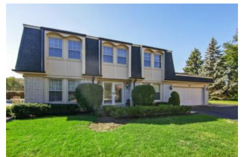
20 Country Court, Deerfield

Opportunity is KNOCKING! Great value on Sunlit expanded Split Level in awesome location.