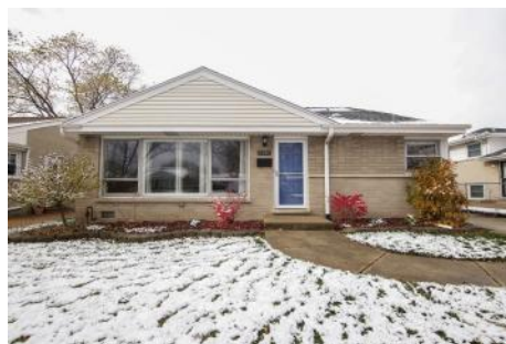
8846 N Merrill Street, Niles

Move right in to this updated Mid-Century Modern 4 bedroom, 3 full bath Beauty!