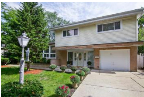
643 Clearview Drive, Glenview

Move right in to this updated Mid-Century Modern 4 bedroom, 3 full bath Beauty!